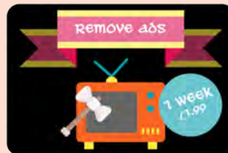
Pay to shop advertisements