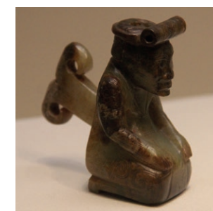
Jade figure found in the tomb of Fu Hao

The skeletons of six dogs and 16 humans were also found in the tomb. These were probably Fu Hao's pets and advisers, sacrificed to accompany her into the afterlife.